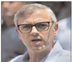
Himalayan Mail News JAMMU, MAR 28

NC vice-president Omar Abdullah today accused BJP leader Gen (ret'd) V K Singh of sabotaging the revocation of AFSPA during the UPA-2 government when he was Army chief.