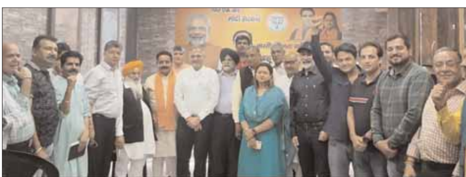
Himalayan Mail News JAMMU, MAR 28

Alleging that NC had deprived people of development during its rule in the erstwhile state, senior BJP