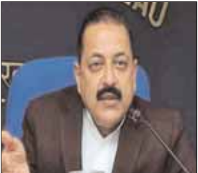
Himalayan Mail News JAMMU, MAR 28

Jitendra Singh, Union Minister and BJP candidate from Kathua-Udhampur Lok Sabha constituency, today said that while the Congress leaders grabbed land from the poor, Prime